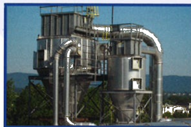
Full Plant System