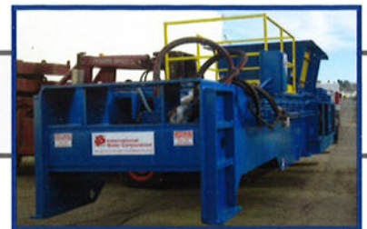
Large 2 Ram Baling System for Non-ferrous Scrap

BE Equipment offers more than 35 years experience providing professional installations of a wide range of recycling equipment types and sizes. Our trained installation crews are equipment experts who know what to anticipate during your installation. They arrive at your site equipped with the proper parts, tools and supplies to complete the installation properly and on schedule.