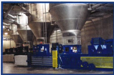
Under Roof System