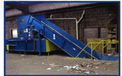
Full Eject Baler Installation at Folding Carton Plant