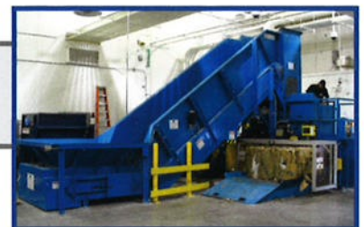
Small 2 Ram Baling System at Government Facility